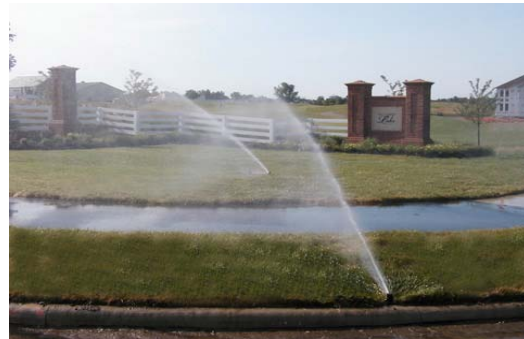
Wrong head type!

Experience the Difference With SLM Value, Experts, Technology and Customer Service.